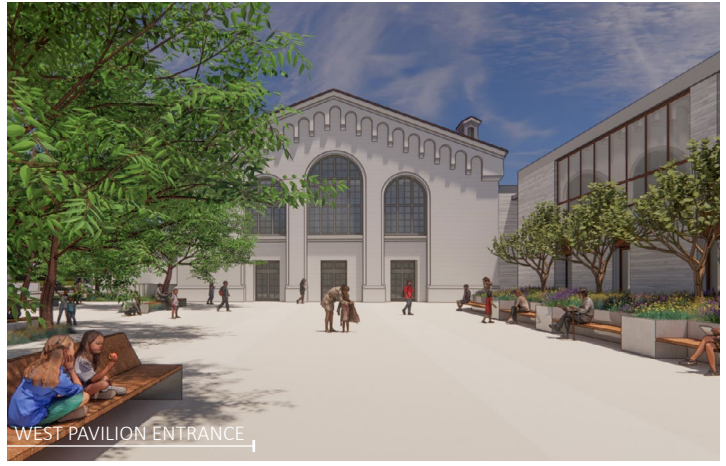
WEST PAVILION ENTRANCE