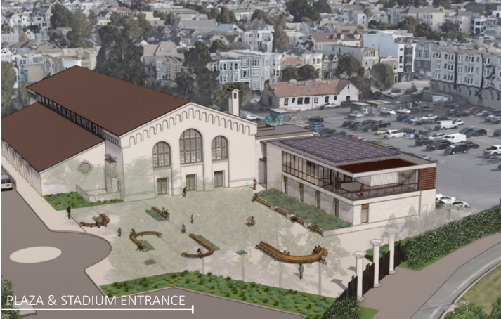
PLAZA & STADIUM ENTRANCE