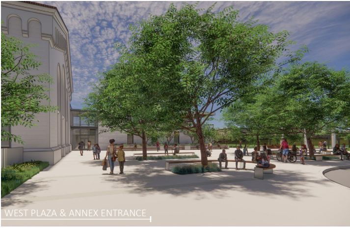
WEST PLAZA & ANNEX ENTRANCE